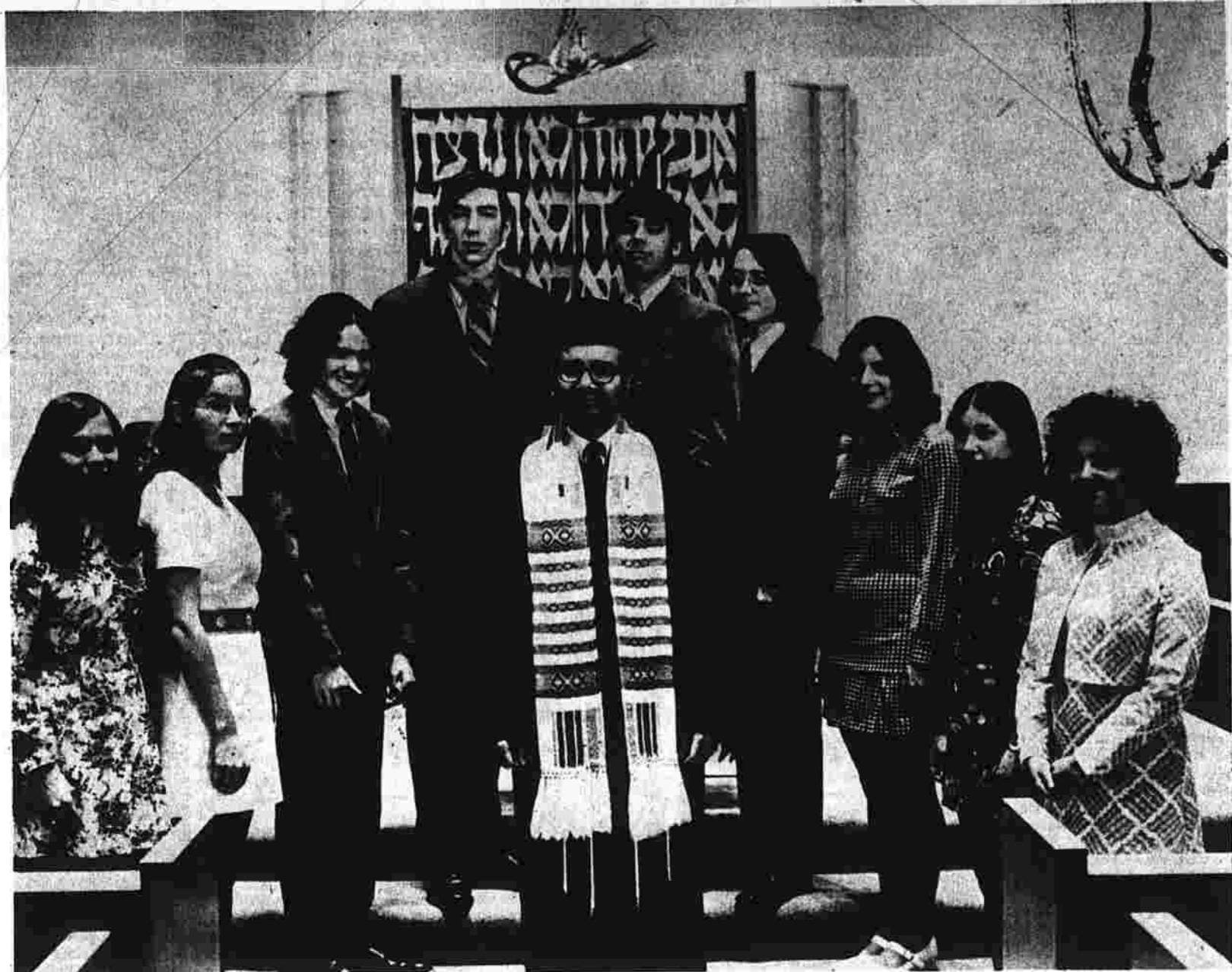
Graduating Class at Temple Beth Shalom